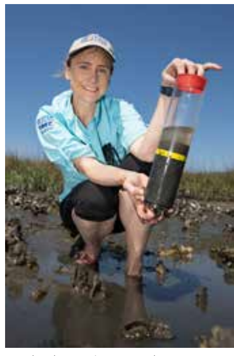
Faculty showcasing research