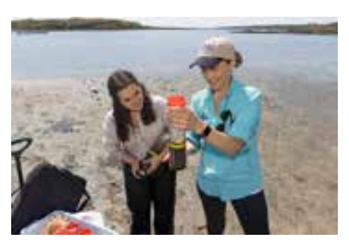
Faculty with student and research