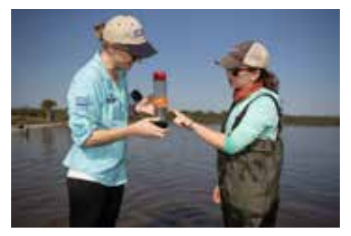
Faculty with student and research